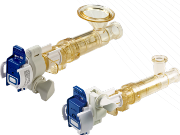
Combination SIP/sterile connectors for hybrid systems