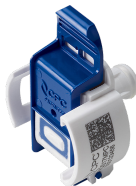
AseptiQuik S with MPC termination connector

For applications like bag sets that have to be connected in a hood, AseptiQuik S MPC connectors allow users to easily move to the bench top. This is beneficial in the cell-culture scale-up process.