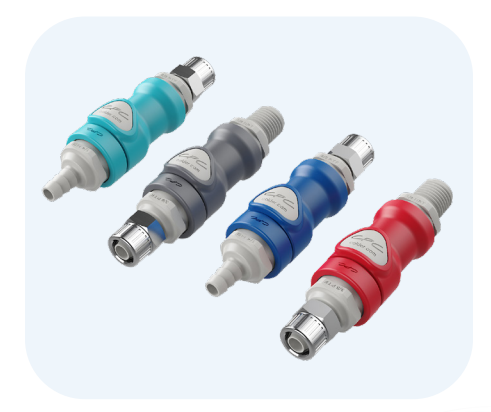
Figure 5: NS4 Series non-spill couplings, shown in available colors.