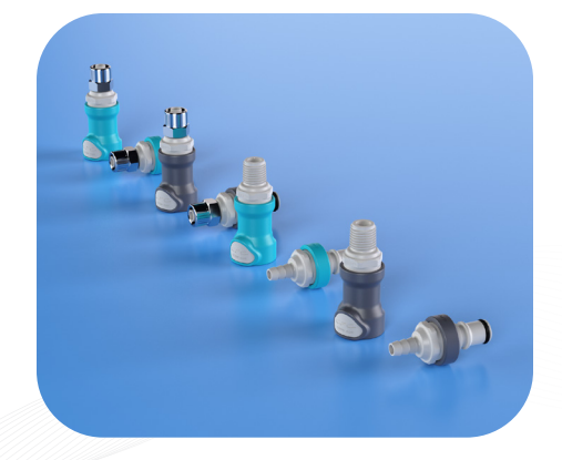
Figure 2: High-pressure non-spill coupling.