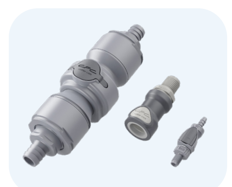
Figure 3: Non Spill Series couplings from CPC

CPC's NSH, CQH, and CQG Series Non-spill couplings offer a novel nonspill valve design that isolates the valve actuation springs from the fluid flow path. The couplings for chemical handling applications feature one degree of separation between the fluid and any metal. The o-ring seals separate fluid flow from the valve actuation springs. The benefit of this design feature is a chemically inert, high purity flow path. The result is a flush-face non-spill coupling that is well suited to high purity and specialty chemical applications.