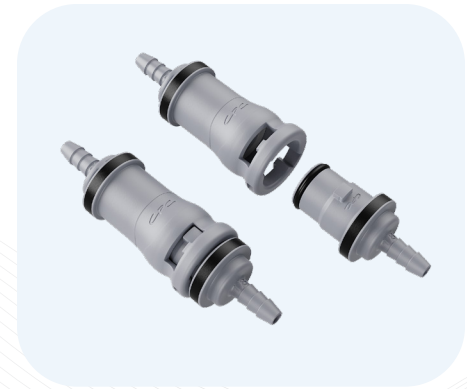
Figure 1: NS2 Series non-spill couplings.

Anyone who has recently looked under the hood of a new car has seen the extensive use of engineering polymers. Weight reduction and improved strength and rigidity, as well as reduced cost, make modern polymers a natural fit for many industrial applications. In quick disconnect coupler design, the use of advanced engineering polymers makes it possible to achieve complex part geometries, meet required chemical compatibilities, and reduce cost when