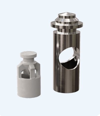
Figure 4: Molded non-spill valve (left) and machined conventional valve (right).